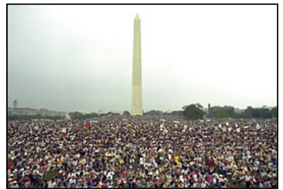
Rally at Washington Monument

To date this was the greatest religious rally ever assembled in Washington, D.C. An estimated 300,000 people of all creeds and colors came to hear him speak at the "God Bless America Festival" on September 18, 1976. At this historic rally, Reverend Moon called upon America to fulfill its blessing as one nation under God, and to create "one world under God." He referred to himself as a "doctor" or a "fire fighter" from the outside who has come to help America meet its third great "test" as a nation, that of "God-denying" communism, and to revive its religious heritage. He proclaimed that the Unification Church with its "absolutely God-centered ideology" had the "power to awaken America, and raise up the model of the ideal nation upon this land."